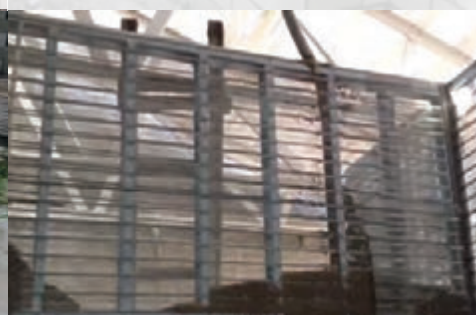
Flexible IBS Grouting