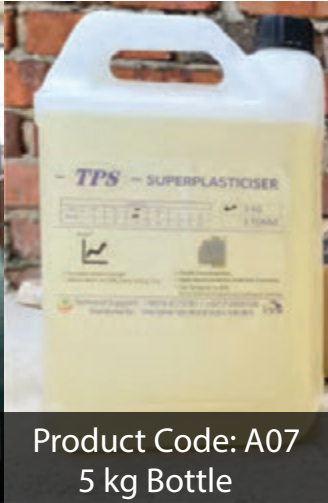
Product Code: A07 5 kg Bottle