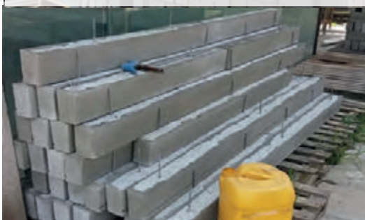
Faster & Stronger Coping Production