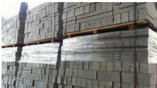
Faster & Stronger Brick Production