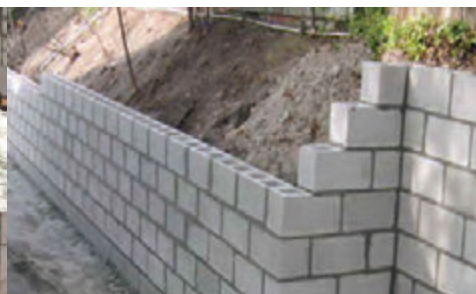
Increase Bricklaying Strength