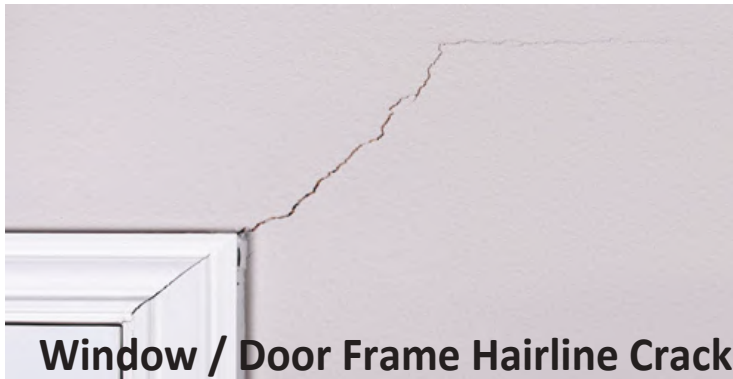
Window / Door Frame Hairline Crack