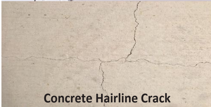
Concrete Hairline Crack