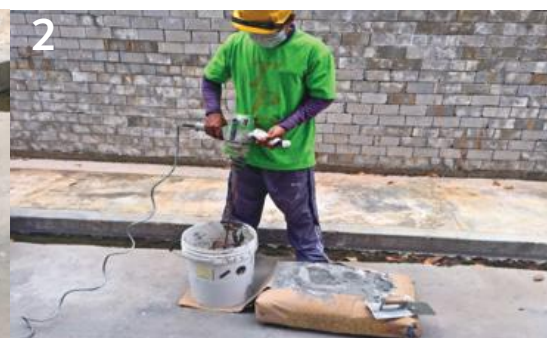
2 Stir with electric mixer until creamy consistency. Use mixture after 3 minutes for best result.