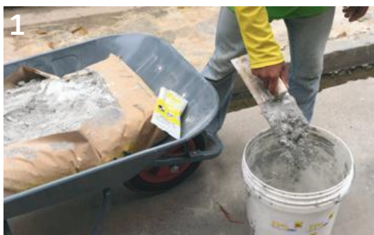
1 Mix TPS Yellow with cement in paint barrel. Mixing ratio based on application required.